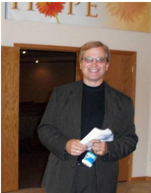
NEW HOPE CHURCH