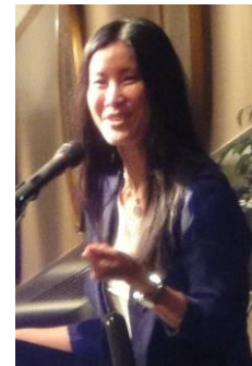
Lisa Ling – keynote speaker (journalist)