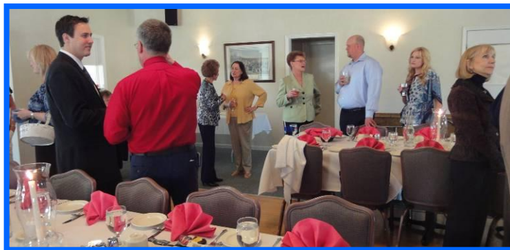
The Charlotte Country Club was the venue.