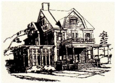
Michigan Women's Historical Center and Hall of Fame