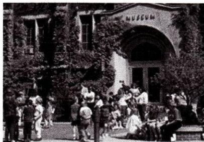
Michigan State University Museum

Michigan's largest public museum of natural science and culture and the state's only land-grant university museum