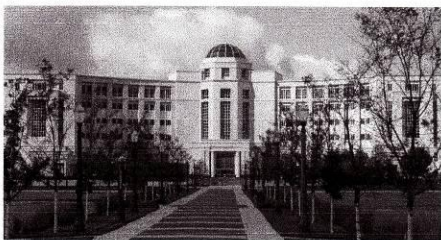
Michigan Hall of Justice and Learning Center