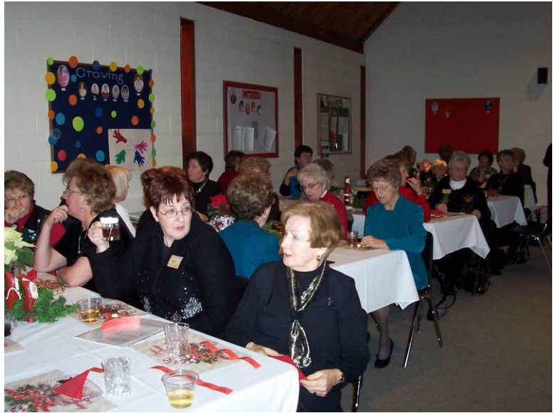
“THE HAT” GETS PASSED AGAIN!